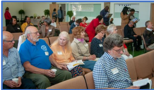
75 registrants from 21 churches participated in the business of the region.